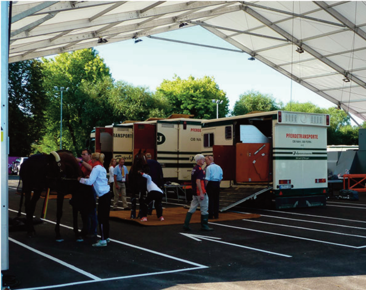
Fig. 2: The Equestrian Staging Facility (ESF)